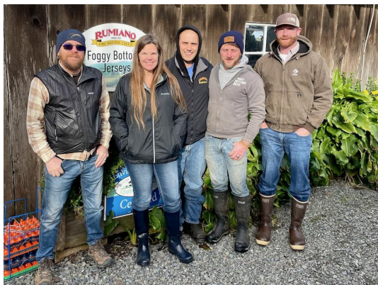
Ranchers and UC Davis team pose in

Below are images of our recent meetings in Eureka (Humboldt county), Woodland (Napa, Solano, Yolo counties) and at Stemple Creek Ranch in Tomales (Marin/Sonoma counties). Two more convenings are planned, one in Tuolumne/Calaveras and another in Placer/Yuba counties, as well as Zoom meetings for folks who weren't able to attend in person. We are knitting a network of producers, processors, buyers and policymakers who have the capacity to create new markets that benefit farmers and ranchers delivering high quality meat and ecosystem services to our state. We will keep you posted!