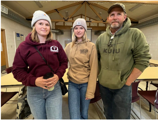
Ranchers from Yolo and Solano county met in Woodland at the UCCE office for an in-person meeting on February 28th.