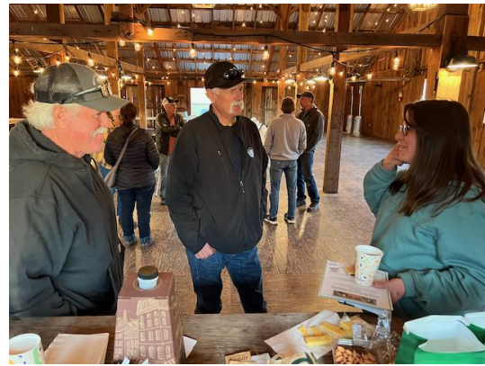
Digesting the presentation over coffee at the beautiful barn at Stemple Creek Ranch.