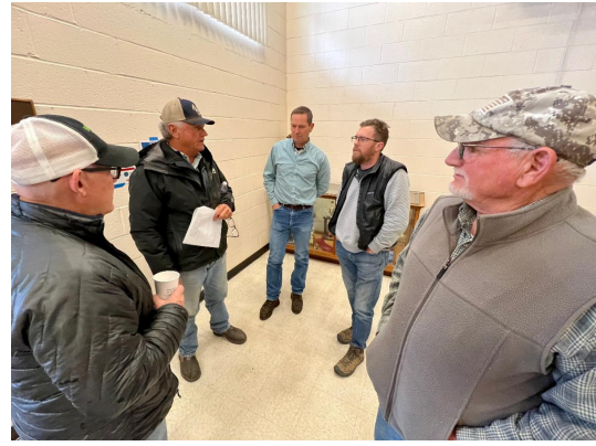
Ranchers engaging in post-meeting conversations in Woodland at the UCCE office.