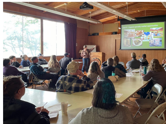
Humboldt ranchers gather for the